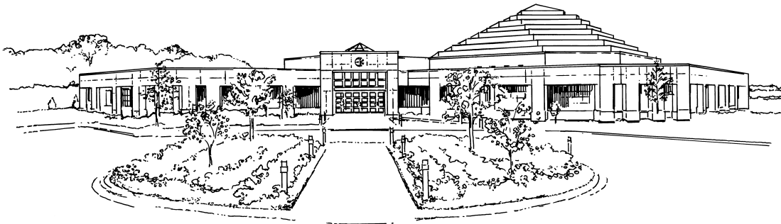
The Temple of ECK, near Minneapolis, Minnesota