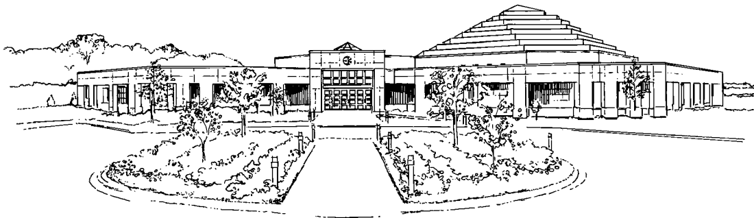
The Temple of ECK, near Minneapolis, Minnesota